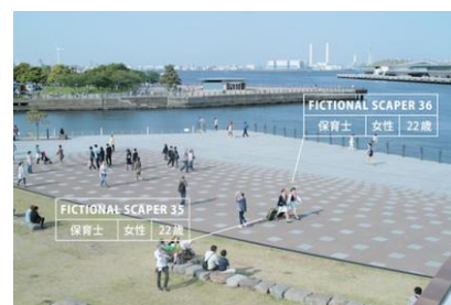
(reference image) [Mé] FICTIONAL SCAPER / 2013

"What if we possessed an organ that allowed us to perceive worlds other than the world that we perceive now?" It is on this premise that the young contemporary artist unit "Me" will conduct research on disabled individuals in the Yokohama metropolitan area for an experimental project to be carried out with disabled Yokohama citizens.