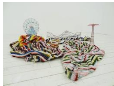
(reference image) Takahiro Iwasaki Out of Disorder (Cony Island) 2012

Pieces of cloth that manifest the workings of the hands and hearts of the disabled individuals who created them will be transformed by Takahiro Iwasaki, an artist who specializes in turning mundane everyday objects into amazingly small and exquisite works of art, into a new world that lies at the intersection of a diversity of worldviews.